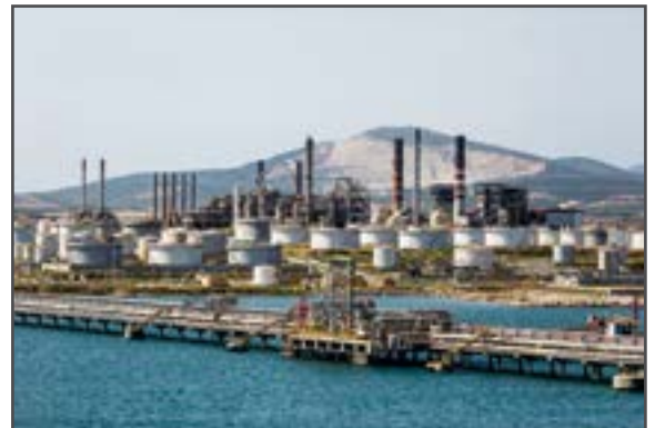
MATCOR's Sea-Bottom Anode provides cathodic protection of docks, piers, pilings and other marine structures in all types of water.

The installation of an entire system can be done very quickly. MATCOR has installed ten Sea-Bottom Anode sleds to protect a thousand-foot long dock in a single day.