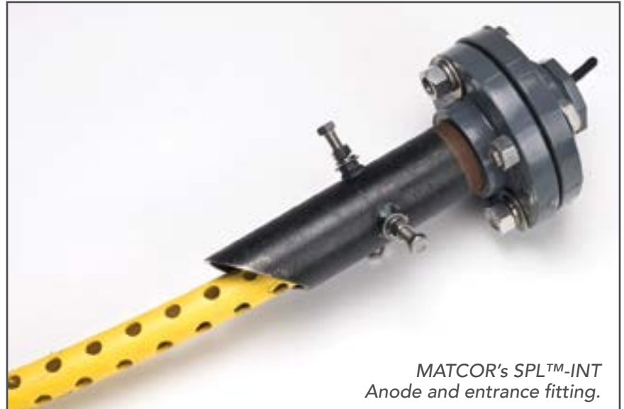
MATCOR's SPL™-INT Anode and entrance fitting.